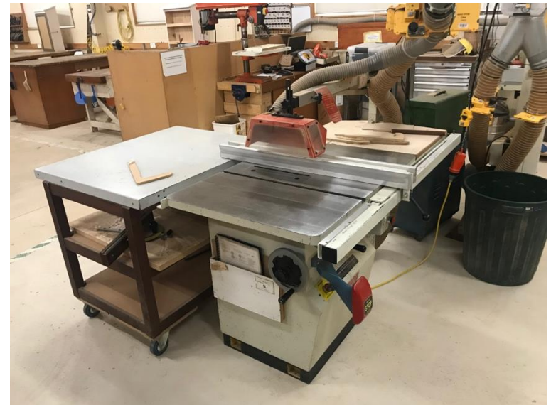
10" table Saw