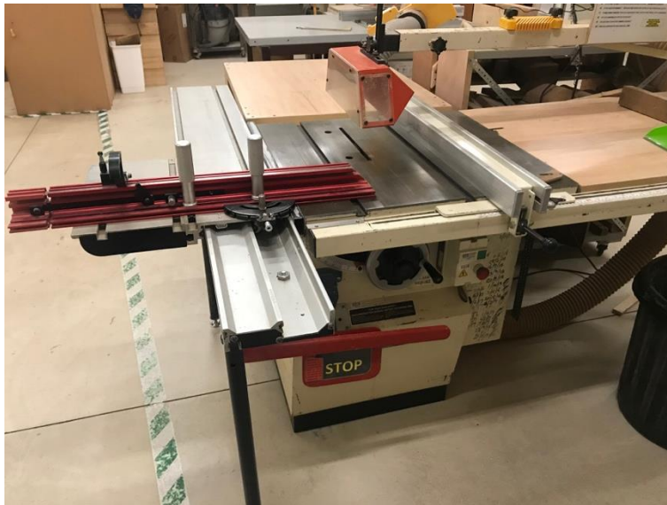
10" Table Saw with Extension