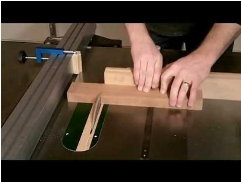
Timber clear of fence on crosscut